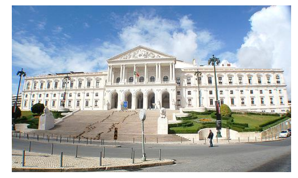
Assembleia da República (The Parliament)

For more information related to Aerobus Carris Service please check their website by clicking on the logo above.