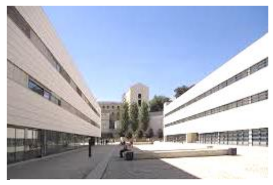
ISEG - Lisbon School of Economics and Managements